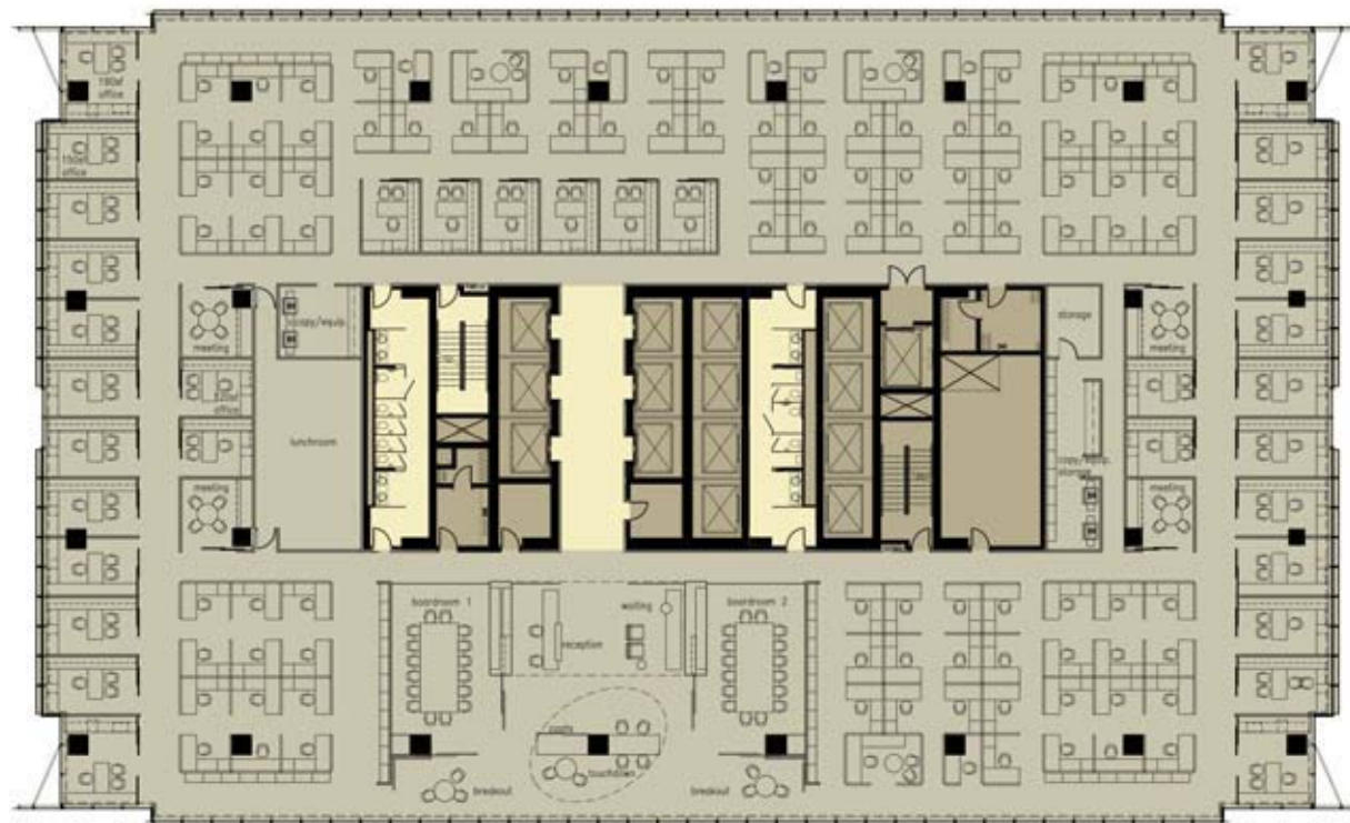
25 York Street, Single Tenant Floor Plan Concept